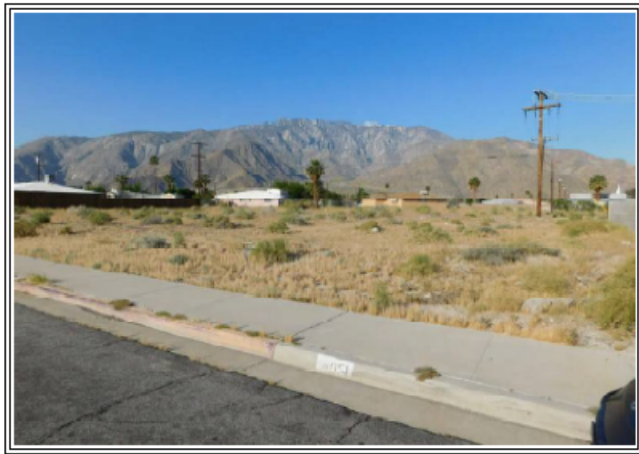
REAR VIEW OF SUBJECT PROPERTY

Appraised Date: March 31, 2017 Appraised Value: $ 35,000