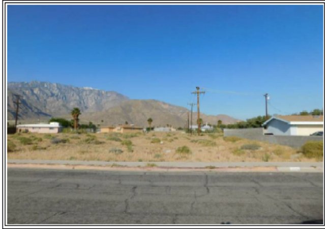
FRONT VIEW OF SUBJECT PROPERTY

Appraised Date: March 31, 2017 Appraised Value: $ 35,000